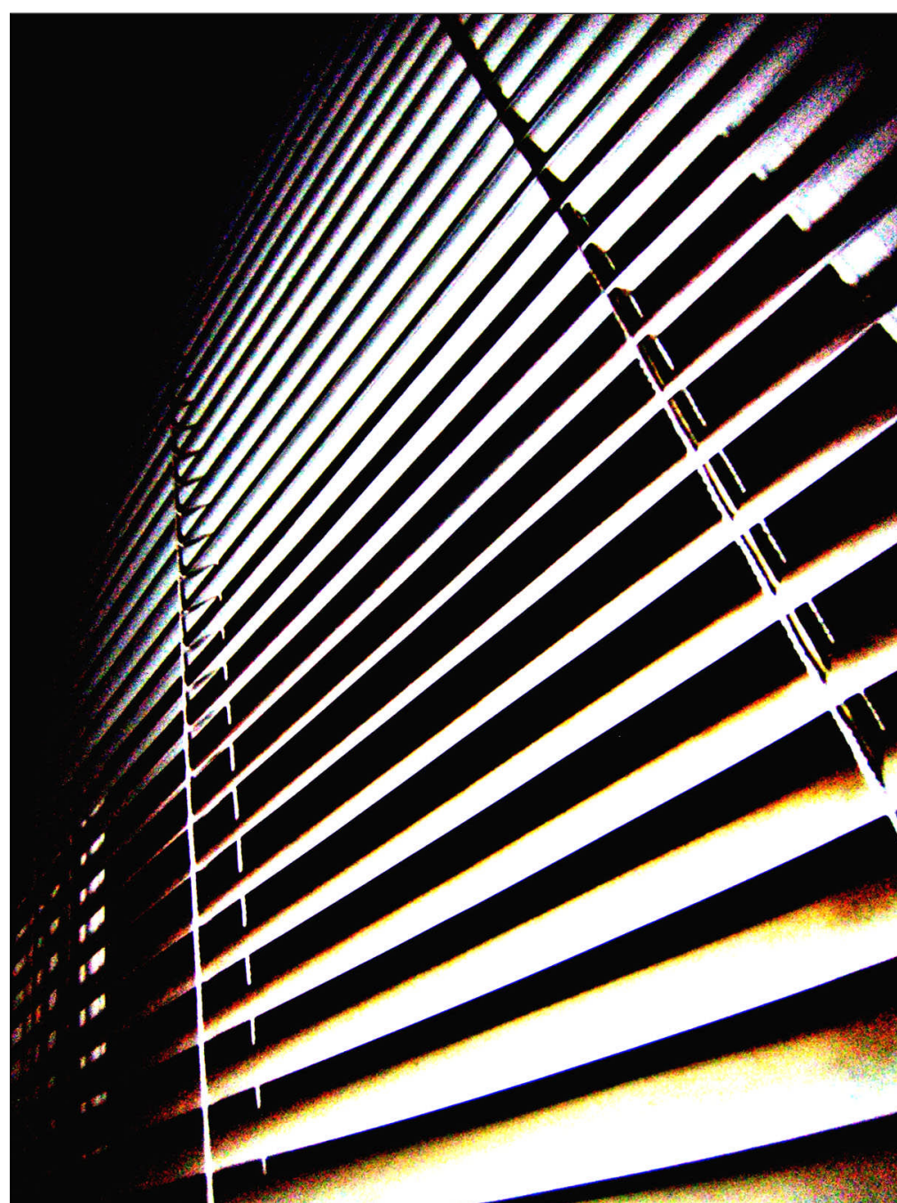
SEAN WAGONER, Essex High School

This photograph is from a series by Wagoner focusing on lighting and the picture angle: "I used high contrast and purposeful lighting to create a strong balance between light and dark and to bring out the object that I was focusing on in each picture, though in a somewhat abstract sense due to the angle. My hope was to create an interesting picture that you could look at for a bit, figuring out what the picture was all about."